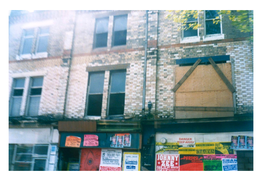
This is actually one of the dives I used to live in.

today, often without food or electricity (electricity was metered and we often ran out of money for it), living it up on dole day partying wildly, and dying of boredom the rest of the time, was not my idea of fun. It took me about two years to totally rid myself of a nasty addiction to victim hood and squalor.