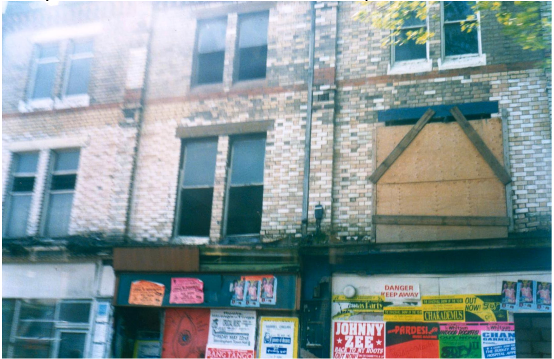
This is actually one of the dives I used to live in.

nasty addiction to victim hood and squalor.